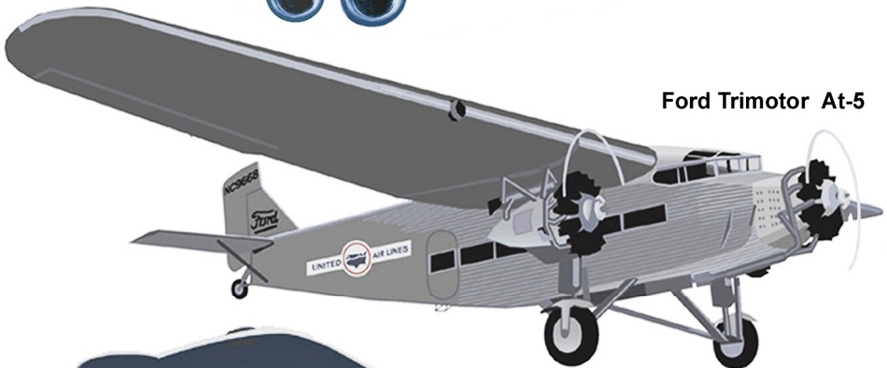
Ford Trimotor At-5