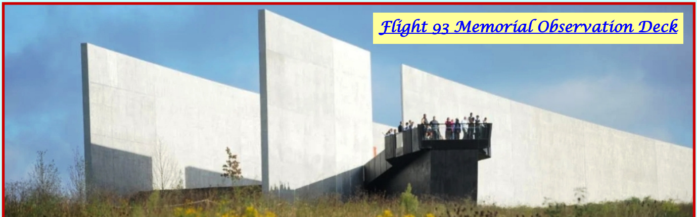
Flight 93 Memorial Observation Deck

United Airlines Flight 93 was a domestic passenger flight from Newark Liberty International Airport in New Jersey to San Francisco International Airport in California. The Boeing 757-200 was hijacked by four al-Qaeda terrorists. Targeted was either the U. S. Capitol building or the White House. The passengers and the crew attempted to regain control of the aircraft from the hijackers. Flight Attendant Sandra Bradshaw boiled water to throw on the hijackers. One of the passengers, Todd Beamer, taking a F/A food cart and yelling "Let's Roll", used it to break down the cockpit door. The cockpit voice recorder captured the sound of passengers yelling, the crashing of dishes and glass, the thumping and breaking through the cockpit door. In response, hijacker Jarrah tried to cut off the oxygen and began pitching the plane up and down trying to knock the passengers off balance. The plane ultimately crashed "vertically" in a field in the Stonycreek Township, Pennsylvania, killing all 44 people on board.