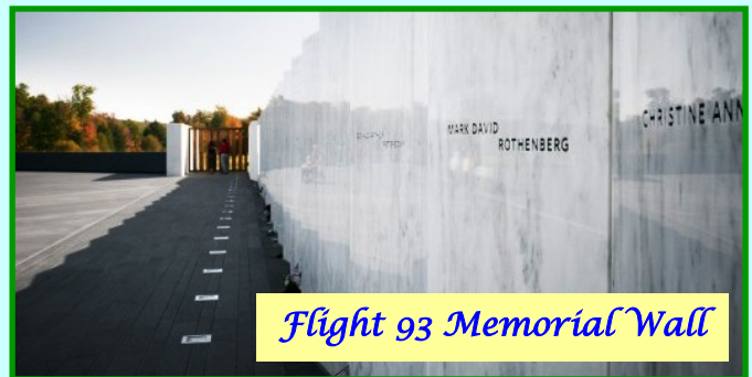
Flight 93 Memorial Wall