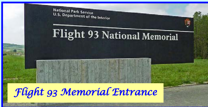
Flight 93 Memorial Entrance

"Preserving the Past, Inspiring the Future"