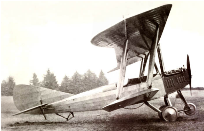
Boeing Model 4 "EA" 1917 - land version of "C".

After failing to interest the Navy in the "B & W" seaplane, William Boeing hired T. Wong, an airplane designer, to develop another seaplane. The result was the "all-Boeing" Model 2 "C", a twin-float seaplane. During test flights, it proved unstable and a larger rudder was installed.