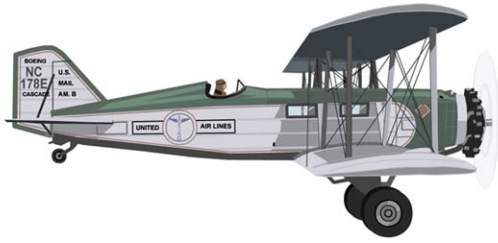
Boeing Model 40