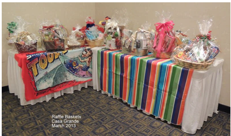
Raffle Baskets Casa Grande March 2013