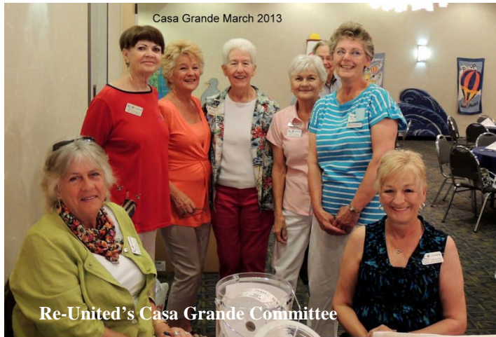
Re-United's Casa Grande Committee