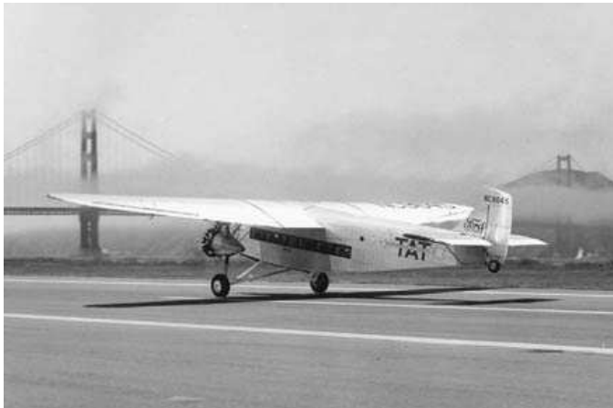
A TAT Ford Trimotor at Crissy Field, San Francisco.

In early 1930, National Air Transport ceased flying passengers and focused on the more profitable mail flights. NAT passenger flights didn't resume until Oct. 1, 1930 following the Stout - NAT merger at Boeing Air Transport.