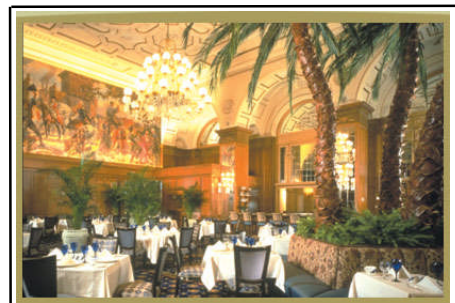
William Penn Hotel Terrace Room

Celebrating the RUAEA 2008 Pittsburgh Convention , wishing all of our RUAEA members could have joined us in Pittsburgh. A lot of inspiration was found at the Pittsburgh's Convention; especially the vintage, ambience, and the elegance of the Omni William Penn Hotel, where all of our RUAEA friends gathered to meet. We also found a city of magic that was so much more than we expected. RUAEA members were warmly greeted with kindness, it was not uncommon for a helping hand to be extended when it was apparent that we were looking for directions or just gazing at the grandeur. That's what makes Pittsburgh – Pittsburgh , truly a warm and friendly city!