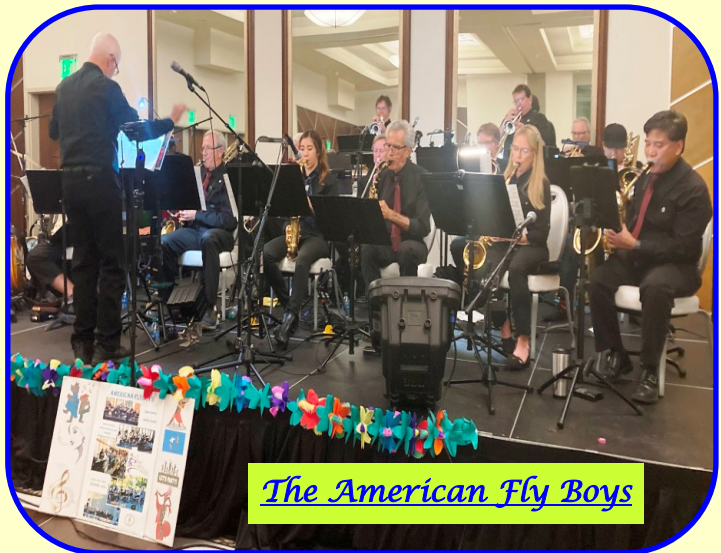
The American Fly Boys

All the presenters will have breakout sessions for your own particular questions or needs. This is one of the primary reasons people attend our Event/Reunion. Please come and participate in the events of your choice; as well as enjoying the camaraderie of your former co-workers and our wonderful host city, San Diego.