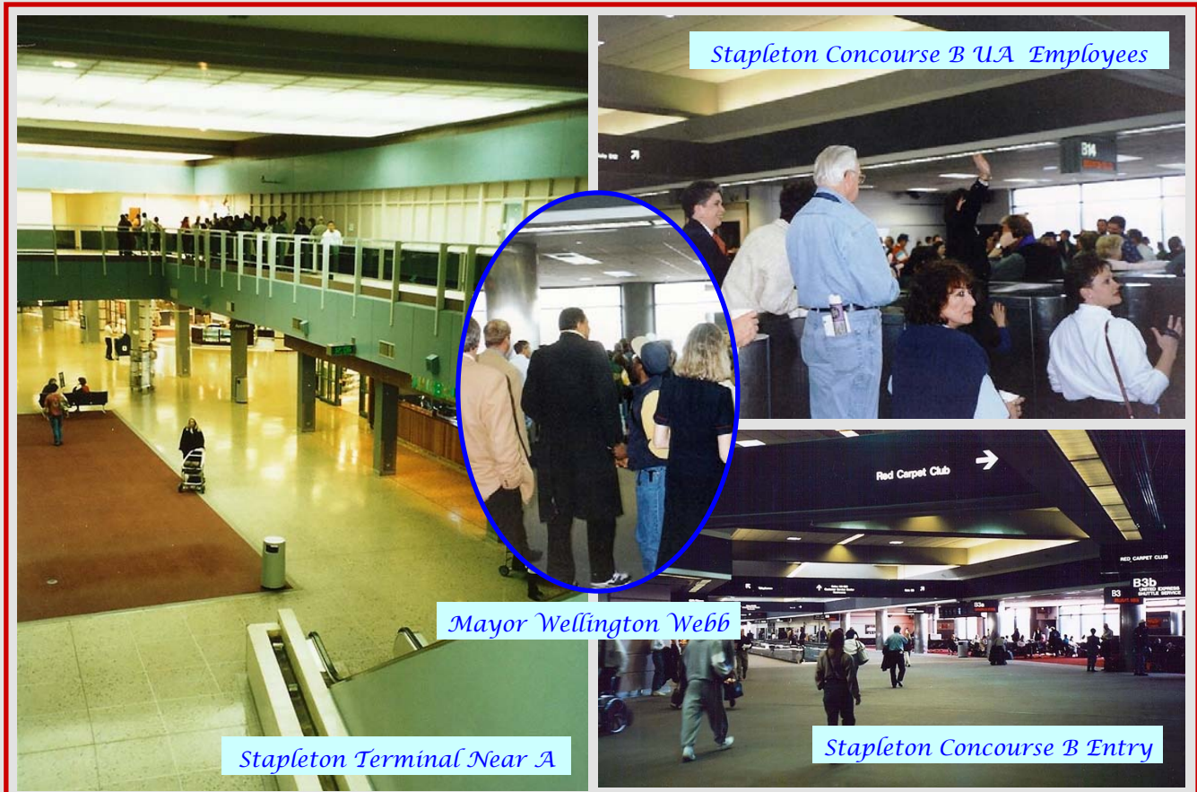
Stapleton Concourse B UA Employees