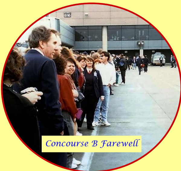
Concourse B Farewell