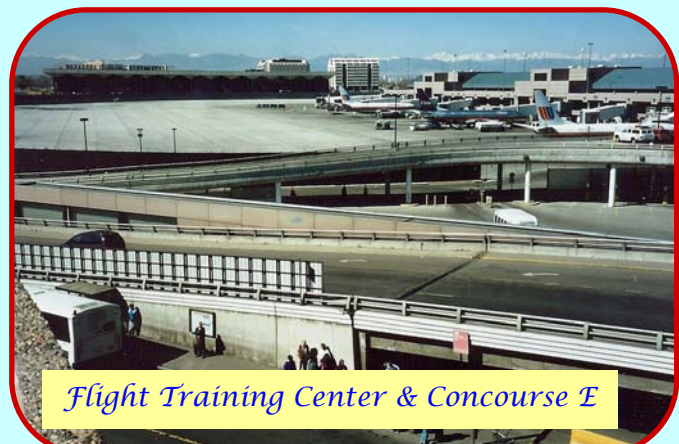
Flight Training Center & Concourse E