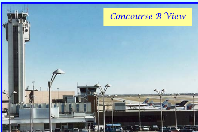
Concourse B View