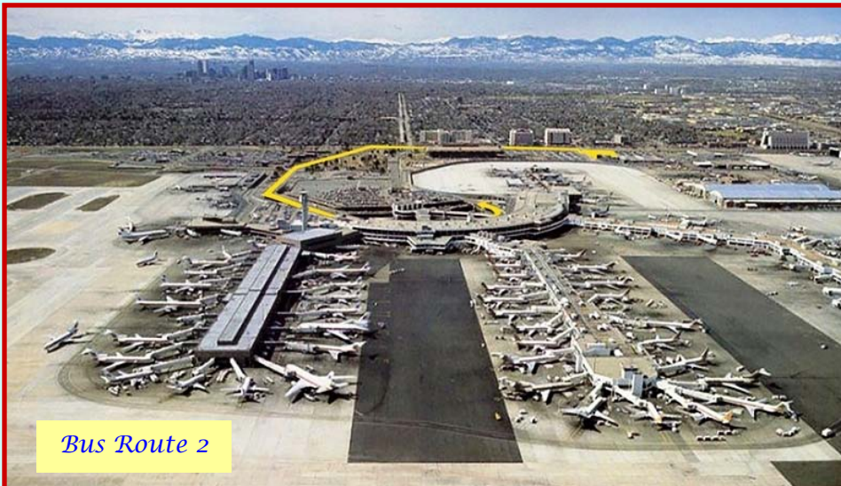
Bus Route 2

Another reason for feeling such affection for Stapleton was the nearly seamless access to our flights of fancy. Living 20 minutes to United's Flight Training Center where I worked, from our Aurora Village East neighborhood, we could be actually be on a flight an hour after deciding and packing for it. It only took minutes to catch an employee bus from the DENTK parking lot, a few minutes ride to the terminal, and a few more through simpler security back in the day. Not that we cut it that close very often – we pulled it off enough times it became legend in our own minds! So it was, on Stapleton's last day, having had a few occasions to drive way out to DIA for an air show and a United Way charity flight auction, that I was already missing the convenience. But it was the history and intimacy of good old Stapleton that I hoped to preserve as I snapped photos of its going away party that day. ■